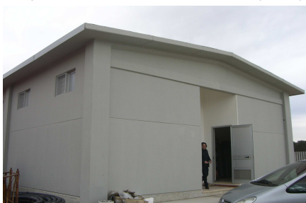
General view of the Control Room