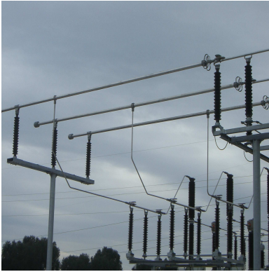
Three phases busbar arrangement