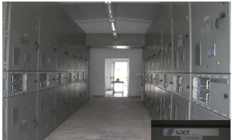
Double Stage Arrangement Panel with 20 kV Distribution

ENERGIA UNO company belongs to DEC SpA (De Gennaro Costruzioni Group) that is active in solar farm and renewables energy. Thanks to the new peculiar rules in Puglia region many single MW solar plants have been developed. ENERGIA UNO has acted as the leader of a Consortium of several single/multiple MW producers interfacing ENEL distribuzione which is connected to the TERNA grid. Therefore in this way ENERGIA UNO became the "owner" of 34MW solar farm in Mesagne (BR) to be connected through a 150/20kV 40MVA Substation (Cabina Primaria Casignano-Brindisi) to the 150kV line San Vito dei Normanni - Brindisi. SAET has been appointed by ENERGIA UNO to build up, on turn key basis, the complete substation together with the HV in-out arrangement. SAET provided the complete plant from the 20kV cables coming from the solar inverters to the HV line (to be cutted with in-out arrangement). The supply is complete with protections, auxiliaries and lighting.