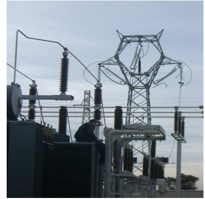
HV bay from transformer to OHL

ENERGIA UNO company belongs to DEC SpA (De Gennaro Costruzioni Group) that is active in solar farm and renewables energy. Thanks to the new peculiar rules in Puglia region many single MW solar plants have been developed. ENERGIA UNO has acted as the leader of a Consortium of several single/multiple MW producers interfacing ENEL distribuzione which is connected to the TERNA grid. Therefore in this way ENERGIA UNO became the "owner" of 34MW solar farm in Mesagne (BR) to be connected through a 150/20kV 40MVA Substation (Cabina Primaria Casignano-Brindisi) to the 150kV line San Vito dei Normanni - Brindisi. SAET has been appointed by ENERGIA UNO to build up, on turn key basis, the complete substation together with the HV in-out arrangement. SAET provided the complete plant from the 20kV cables coming from the solar inverters to the HV line (to be cutted with in-out arrangement). The supply is complete with protections, auxiliaries and lighting.